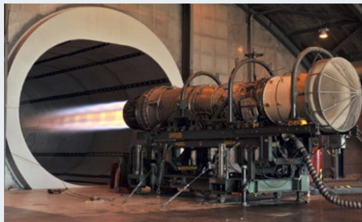
Glass-filled PTFE fire resistant braided shielding is ideally suited for cable protection adjacent high-heat engine applications