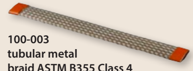
100-003 tubular metal braid ASTM B355 Class 4 OFHC nickel-plated copper