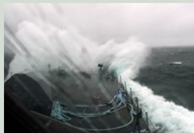
Glenair MIL-DTL-24749 Rev. B Type IV Stainless Steel/Nickel Ground Straps: US Navy qualified and tested to survive extreme environments

Lugs - 316L Stainless Steel/Passivate Braid - 316L Stainless Steel 36 AWG, 50%; 200 Nickel 36 AWG, 50%