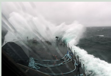
Glenair MIL-DTL-24749 Rev. C Type IV Stainless Steel/Nickel Ground Straps: US Navy qualified and tested to survive extreme environments

Lugs - 316L Stainless Steel/Passivate Braid - 316L Stainless Steel 36 AWG, 50%; 200 Nickel 36 AWG, 50%