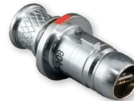
Series 804 Plug Connector with Micro-B USB