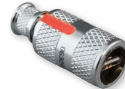
Series 804 In-Line Receptacle