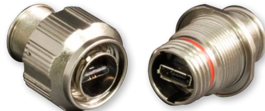
Series 801 Mighty Mouse Plug and Receptacle with SuperSeal® Micro-B USB