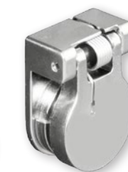
Spring-Loaded cover for Series 804 Jam Nut Receptacles