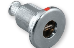
Series 804 Front Panel Jam Nut Mount Receptacle