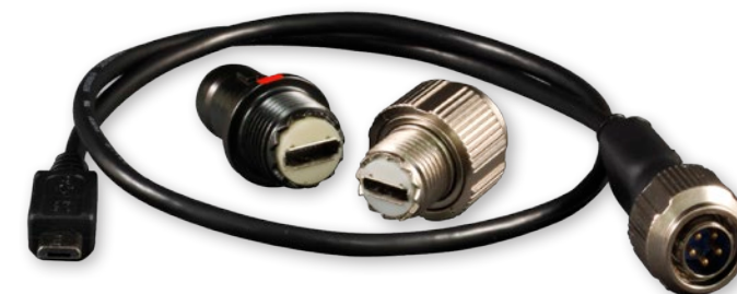
Plug-and-Play Micro-USB Plug and Receptacle