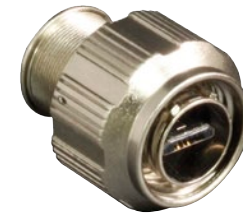
Series 801 Plug Connector with Micro-B USB