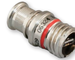
Series 801 In-Line Receptacle