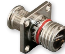
Series 801 Square Flange Mount Receptacle