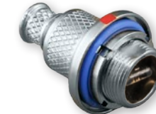
Series 804 Rear Panel Jam Nut Mount Receptacle