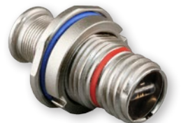
Series 801 Rear Panel Jam Nut Mount Receptacle