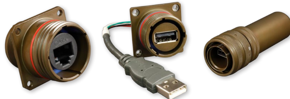
MIL-DTL-38999 Series III with sealed RJ45

Triple-start mating MIL-DTL-38999 type connectors with IP68 sealing (mated condition), robust insert-to-shell grounding, and a complete range of wire, cable, and circuit board terminations