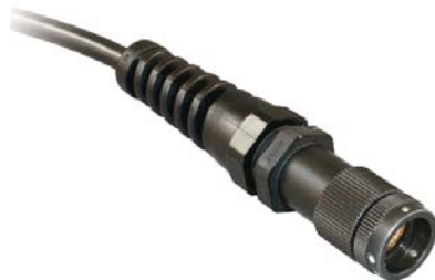
PG Adapter with Flexible Cordgrip, with CB Plug and Jacketed Cable

PG thread adapters fit all CB Series connectors with M14 x 1 accessory threads. These adapters accept all standard PG 7 liquid tight cordgrips.