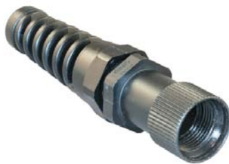
PG Adapter with Flexible Cordgrip