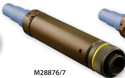
M28876/7 plug with backshell