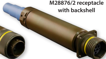
M28876/2 receptacle with backshell