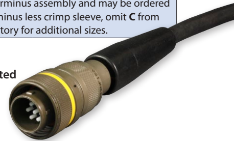
Terminated and tested MIL-PRF-28876 fiber optic cable assembly

Crimp sleeve is supplied with terminus assembly and may be ordered separately (see Table II). For terminus less crimp sleeve, omit C from end of part number. Consult factory for additional sizes.