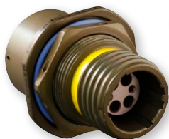
M28876/11 jam nut receptacle