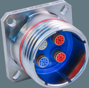
Ultra-light weight Octaxial contacts for 10Gb data transfer per contact