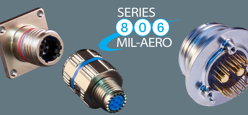
High-vibration and shock environmental plug and receptacle