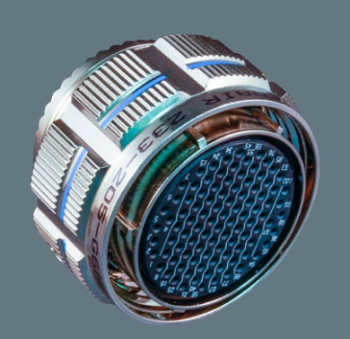
Anti-decoupling, high vibration ratcheting coupling nut for ultimate safety and reliability