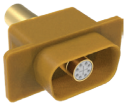
Pin Contact Adapter