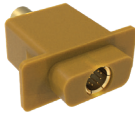
Socket Contact Adapter

Test your system or cable while preventing damage to expensive cables with El Ochito® test adapters. These test adapters properly align test contacts without the added expense and time-consuming labor of mating connectors. Insert adapter cable into adapter then push test adapter into Device Under Test (DUT).