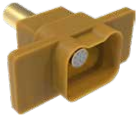
Pin Contact Adapter