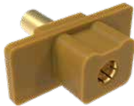
Socket Contact Adapter

Test your system or cable while preventing damage to expensive cables with El Ochito® test adapters. These test adapters properly align test contacts without the added expense and time-consuming labor of mating connectors. Insert adapter cable into adapter then push test adapter into Device Under Test (DUT).