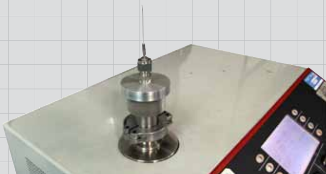
Close up of gas tube assembly undergoing helium leak test at the Glenair Factory in Glendale, CA