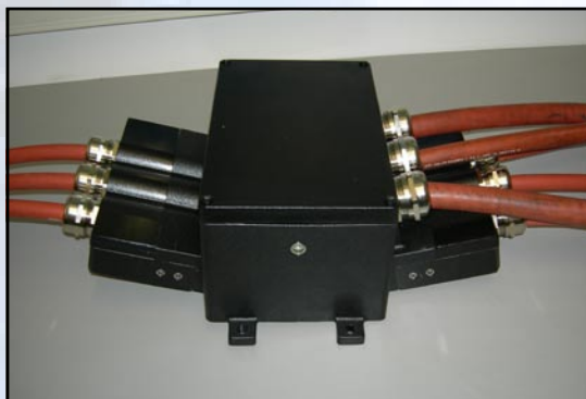
Shunt Box - Lateral view