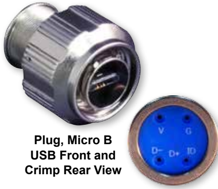
Plug, Micro B USB Front and Crimp Rear View