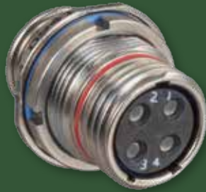
Series 801 receptacle with 181-075 socket termini