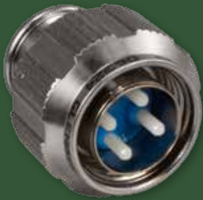
Series 801 Plug with 181-057 pin termini