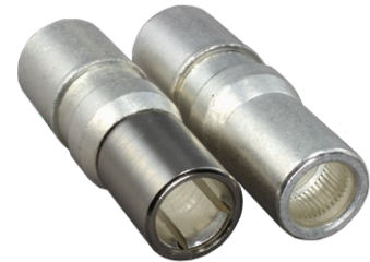
Figure 2 Conventional Contact on the Left, LouverBand Contact on the Right