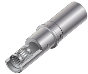
Figure 1 LouverBand Socket Contact