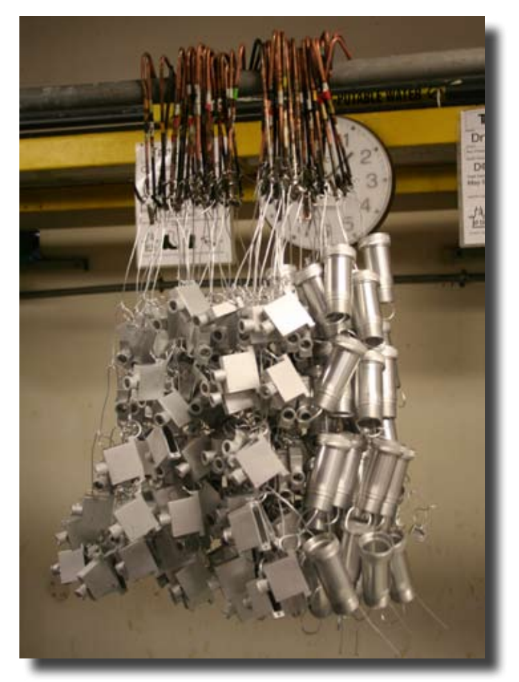
Component parts must be individually wired in order to form the electrical circuit required in the electroplating process. When current is passed through the electrolyte rich plating solution, the parts become the cathode and the sacrificial plating material becomes the anode in the galvanic process.

common finish of this type provided by Glenair. Other choices include cromate over cadmium, zinc-cobalt, and zinc-nickel.