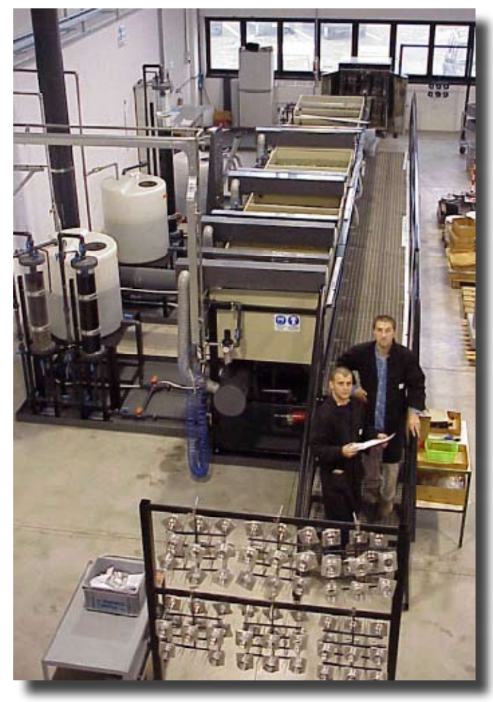
Glenair's electrodeposited paint line is used primarily for commercial grade components, such as our MIL-DTL-5015 (ITS) and MIL-DTL 26482 (IPT-SE) type connector series.

Electrodeposited paint, also referred to as electrocoating, electrophoretic deposition, or electropainting, is an organic finishing