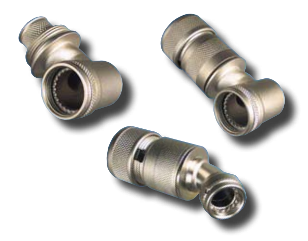
Passivation, combined with a high quality grade of stainless steel, can create products which are extremely corrosion-resistant and will provide many years of service.

According to ASTM A380, passivation is "the removal of exogenous iron or iron compounds from the surface of stainless steel by means of a chemical dissolution, most typically by a treatment with an acid solution that will remove the surface contamination, but will not significantly affect the stainless steel itself." The ASTM spec goes on to describe passivation as "the chemical treatment of stainless steel with a mild oxidant, such as a nitric acid solution. for the purpose of enhancing the spontaneous formation of the protective passive film." Passivation removes "free iron" contamination left behind on the surface of the stainless steel from casting, machining and other secondary operations. These contaminants are potential corrosion sites if not removed.