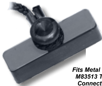
Fits Metal Shell M83513 Type Connectors