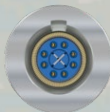
SuperFly Datalink Blue SuperSpeed USB