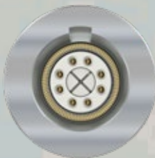
SuperFly Datalink White 10G Ethernet

High speed, harsh environment SuperFly ® Datalink connectors—shielded for 10Gb Ethernet and SuperSpeed USB protocols—deliver outstanding signal integrity and save significant size and weight compared to Quadrax solutions.