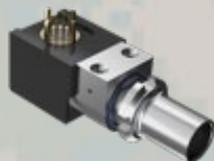
Right Angle PC Tails