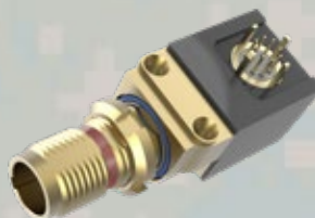
Conformal-coating-compliant panel mount connectors