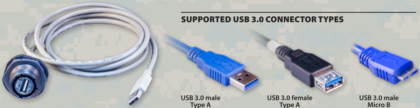
USB 3.0 male Type A