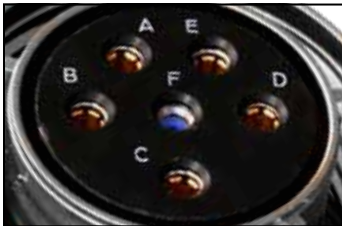
Cavity F contains a Pitot tube Socket contact

Stainless steel pneumatic contacts fit MIL-DTL-38999 connectors. Contacts snap into size #12 cavities. Attach to 3/32 inch (2.38) diameter tubing. Socket contact has fluorosilicone O-ring and PTFE backup washers. Originally designed for pitot tube connections, these pneumatic contacts are rated for 100 psi maximum air pressure. No installation tool is required. Remove contacts with plastic extraction tool 809-132 (M81969/14-04).