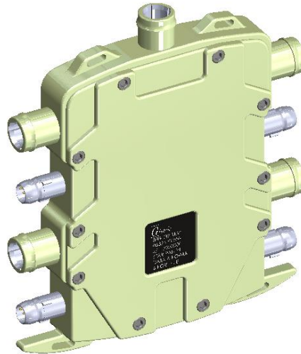
Rear View 6 Port Hub