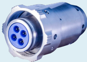
SeaKing™ Power Cable Connector Plug (CCP)