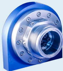
SeaKing™ Power API-Compliant Flange Connector Receptacle (FCR)