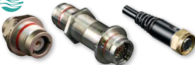
AquaMouse 3500 PSI miniature connectors