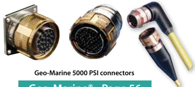
Geo-Marine 5000 PSI connectors