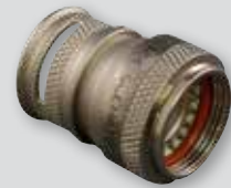
Easy-to-Install Guardian system