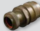
Super Durable Internal Braid System