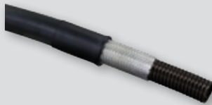
Helical Convulated Tubing