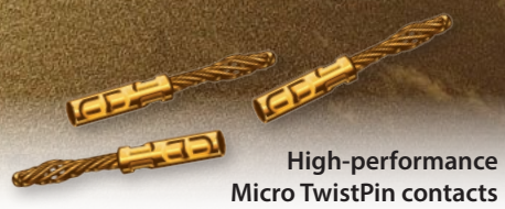
High-performance Micro TwistPin contacts