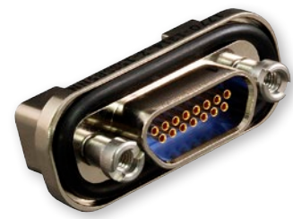
Rear Panel Mount

MIL-DTL-83513 AND COMMERCIAL Micro-D Connectors Mission-critical mating performance