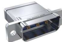
Series 795 RF