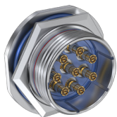
Series 23 SuperNine "Better than QPL" MIL-DTL-38999 Series III