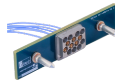
VITA 67.3 RF VPX modular connection system